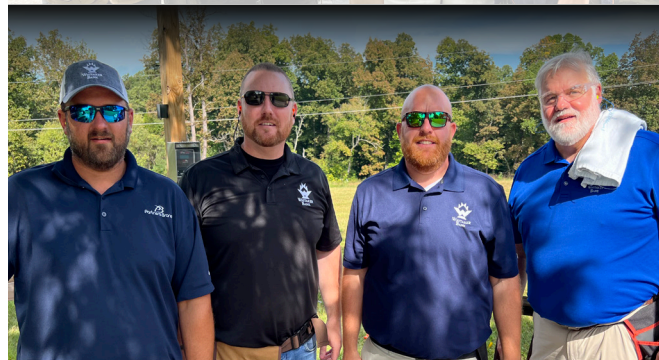
Whitaker Bank - 2022 Green Bird Sponsor