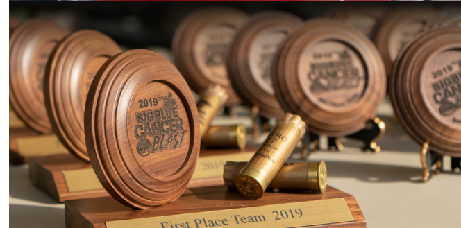
All photos courtesy of Boone Clark Photography. See more at www.bigbluecancerblast.com